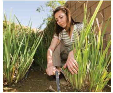
Check sprinkler nozzles for leaks

To find leaks in your sprinkler system, walk your irrigation lines and inspect your valves. Check for unusual wet spots caused by leaky or broken sprinkler heads. Run your sprinklers and if you have any broken sprinkler heads, replace them as soon as possible.