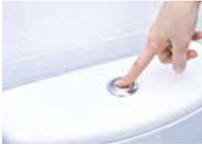
Gallons per flush are printed on the toilet bowl or tank

If you need 3 gallons or more of water to fill the tank, replace the toilet with an high-efficiency model that uses 1.28 gallons or less.