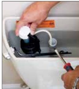
Check your toilet for leaks.