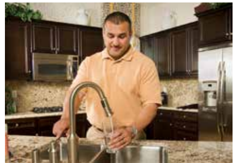
Conserve water at the tap

To find out how much water flows out of your faucets, place a 1-gallon container under a faucet. Turn on to the normal flow and measure how long it takes to fill the container.