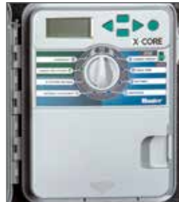
Install a smart irrigation controller.