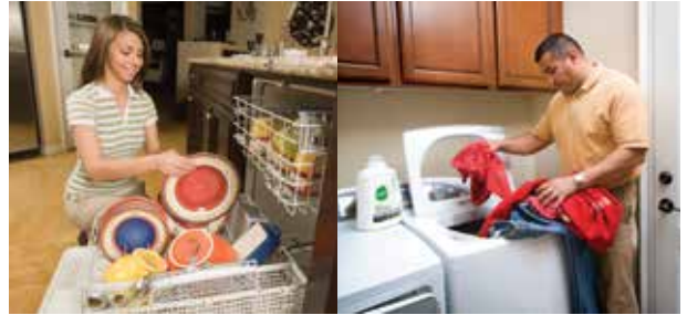
Only wash full loads of dishes and laundry to save water!

If you are shopping for a new washing machine or dishwasher, consider water-efficient models. An ultra high-efficient washing machine may use up to 60 percent less water than your older machine.