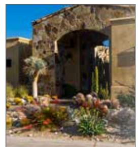
Replace your lawn with desert-friendly, water-efficient plants.