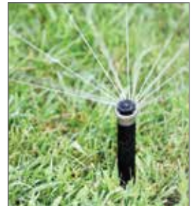
Replace sprinkler spray heads with MSMT nozzles.