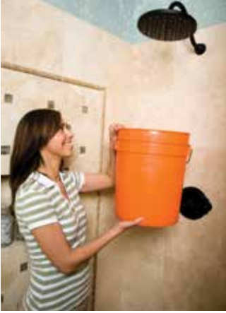
Measure shower head output

Lots of people love a long shower. But do you know how much water you use for every extra minute you spend in the shower?