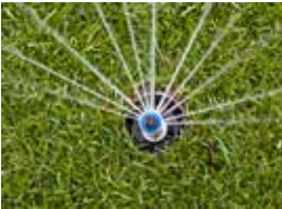
Multi-stream, rotating nozzle apply water more efficiently than traditional spray heads

Place irrigation for water-efficient plants on separate valves than the grass so they get the correct amount of water. In areas with plants but no grass, replace spray head sprinklers with a drip irrigation system.