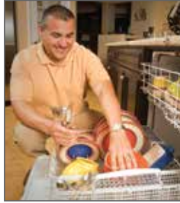
Only wash full loads of dishes and laundry.