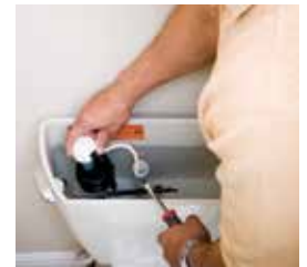
Fix toilet tank leaks

Leaks in toilets always get larger and more costly over time.