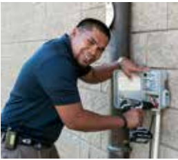
Adjust sprinklers with the seasons

CVWD customers who install a smart irrigation controller, may reduce their outdoor water use by up to 26 percent! If you do not have a smart irrigation controller, you may be eligible to receive one for free. Visit www.cvwd.org/rebates to fill out an application.