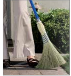
Use a broom instead of the garden hose.