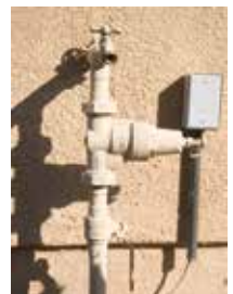
House gate valve

Check the meter. If the meter leak dial or disk still moves, you have a leak outdoors, in your irrigation system or in the water line between the meter and the house. If not, you have a leak indoors.