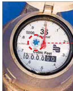
Residential water meter