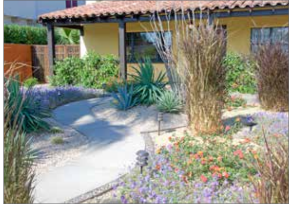
Desert landscaping needs less water than lawns.

Overwatering, inefficient sprinklers, older irrigation systems, poorly designed landscapes and water-thirsty plants are the biggest water wasters.