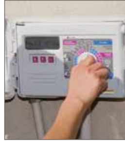
Adjust your sprinklers with the seasons.