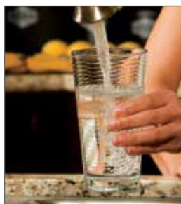
Replace appliances and fixtures with water-efficient models.