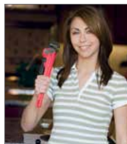
Determine your household water usage and fix leaks immediately.