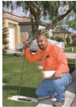
CVWD meter reader

Multiply #8 by 30 days to get an estimate of your monthly usage: _____