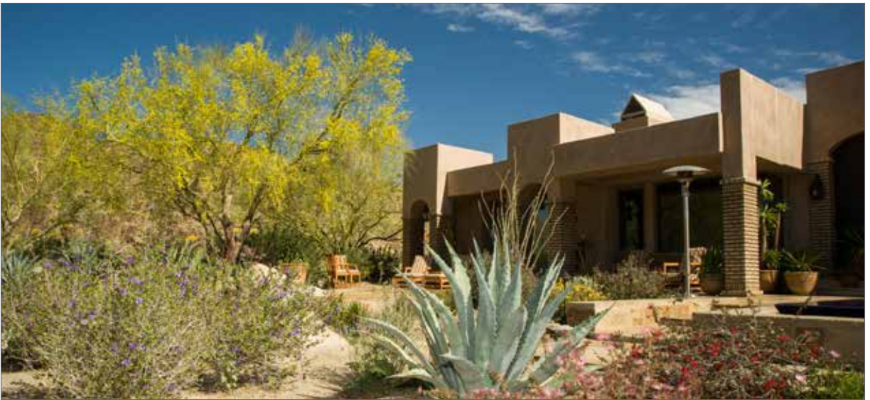
Desert-friendly landscaping uses less water and requires less maintenance than grass