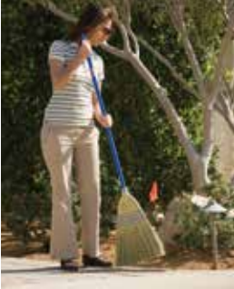
Conserve water at the tap

A typical 5/8" garden hose can use 12 to 15 gallons a minute. Use a broom instead of the hose to clean walkways and driveways according to state law.