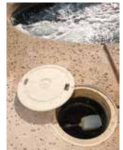
Pool fill valve

If your pool has a vinyl liner, look for sinkholes where sand under the liner may have washed away. If the liner is old, it may have small pinhole leaks. If an animal has fallen into your pool, it may have clawed the liner and torn a hole. Spending time underwater with a mask may be required to find small leaks in the liner.